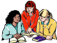
Women's Bible Study

Women's Bible Study Resumes in September