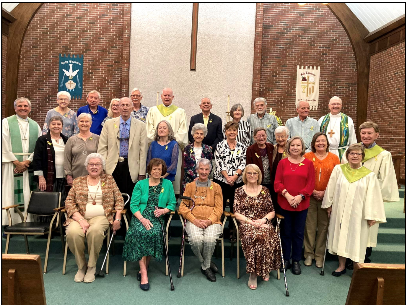
Grace honored our Golden Age members on Homecoming Sunday.

We celebrated 165 years of Grace at Homecoming on Sunday, October 20, with a wonderful worship service, delicious covered dish meal, and lots of fun and fellowship. Check out our Facebook page if you want to take a peek at some of the great pictures taken.