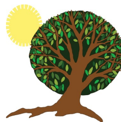
Summer Stewardship Reminder

A congregational meeting right after church on Sunday to vote on pastor and package. We would really like for everyone to be present if possible.